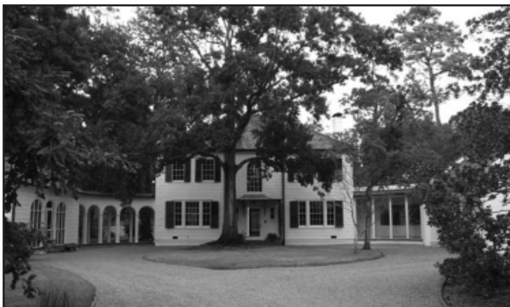
The William Clayton Summerhouse as it looks today.